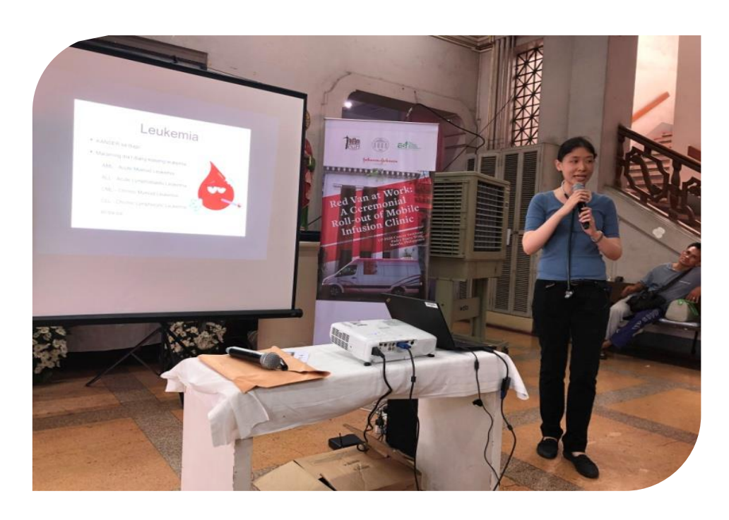
Cancer Lecture with cancer patients and family members during the roll-out of Infusion Van donated by J & J to ASF for the Cancer Institute at UP-PGH