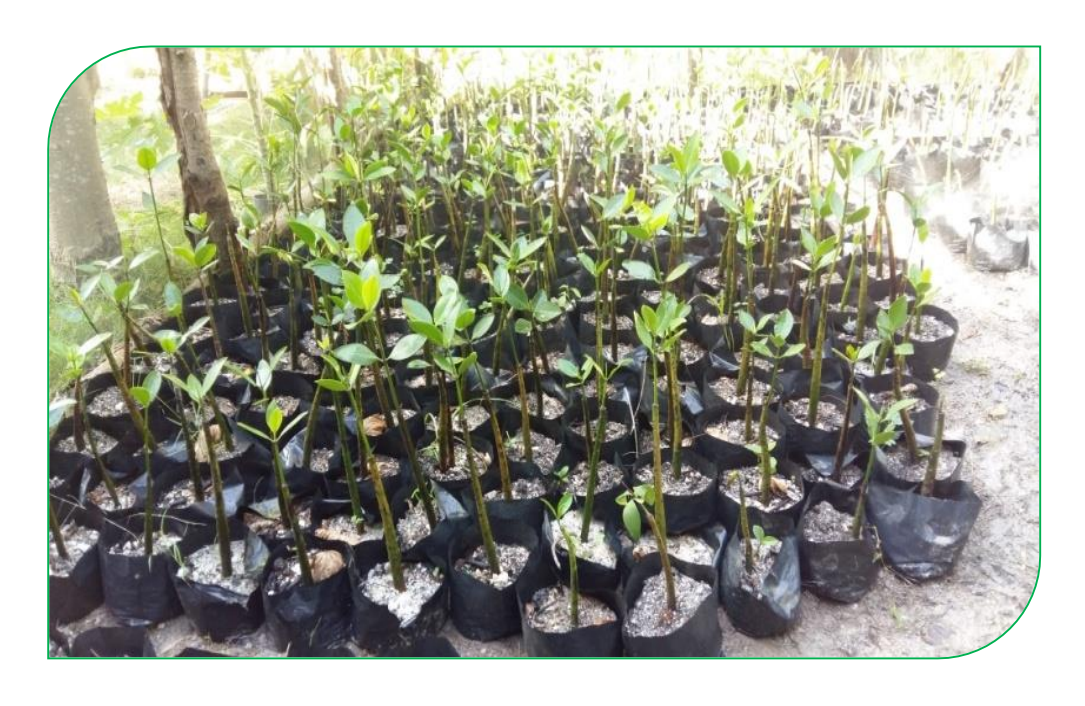
Potted Mangrove Propagules ready for planting from ASF Greenhouse