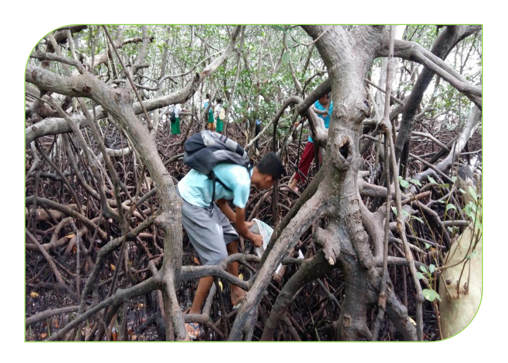
Mangrove and Coastal Clean-up by students