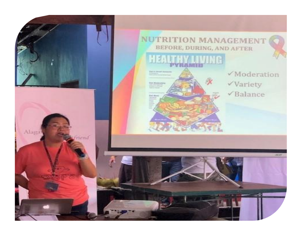
Cancer lecture and Outreach Program in Ternate, Cavite