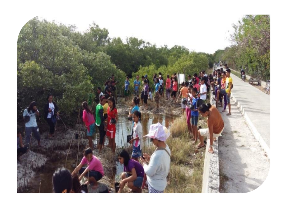
Mangrove planting participated by teachers and students