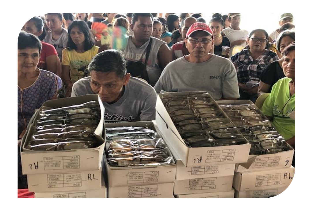
Cancer lecture and Outreach Program in Ternate, Cavite