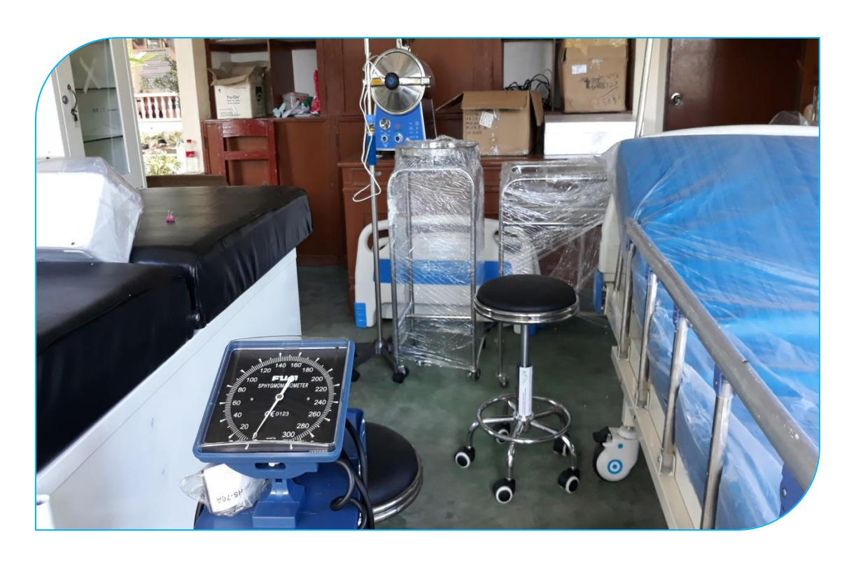
Various basic medical equipments donated by ASF and Partner For use by the Manamoc Barangay Health Station