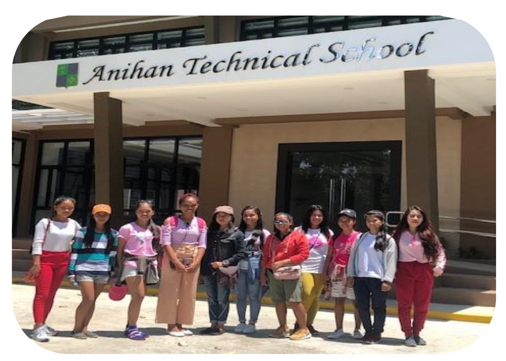
11 Tech-Voc Scholars enrolled at Anihan Technical School last June 2019 for a 1-year course on Quick Service Restaurant Operation