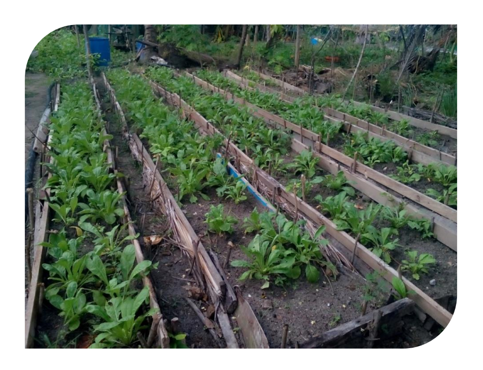
ASF maintains its demo vegetable farm as a show window for community replication.