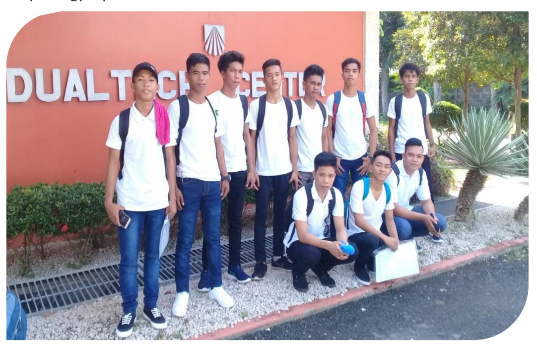
10 Tech-Voc Scholars enrolled at Dual Tech last June 2019