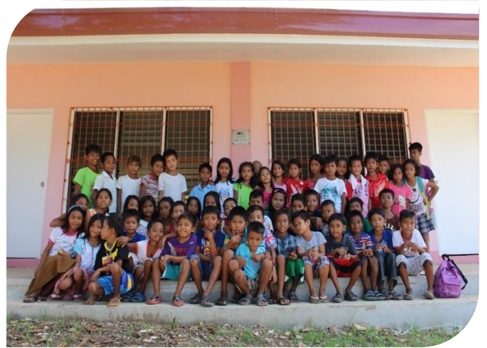
▪ School Facilities and Equipment