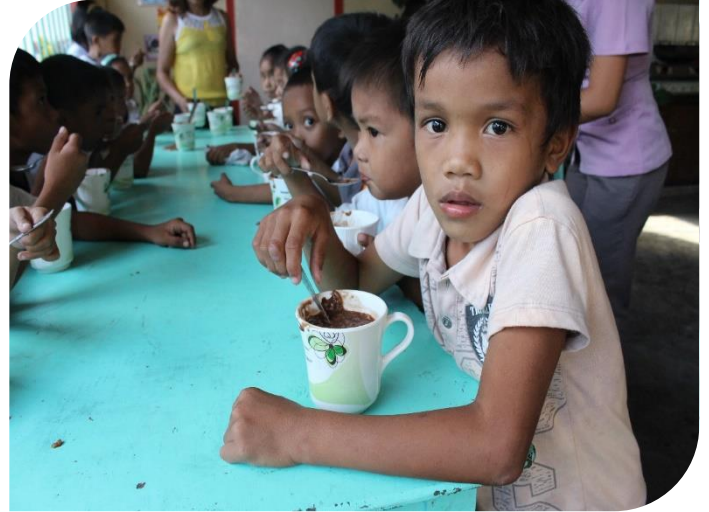
b. TB-DOTs Project