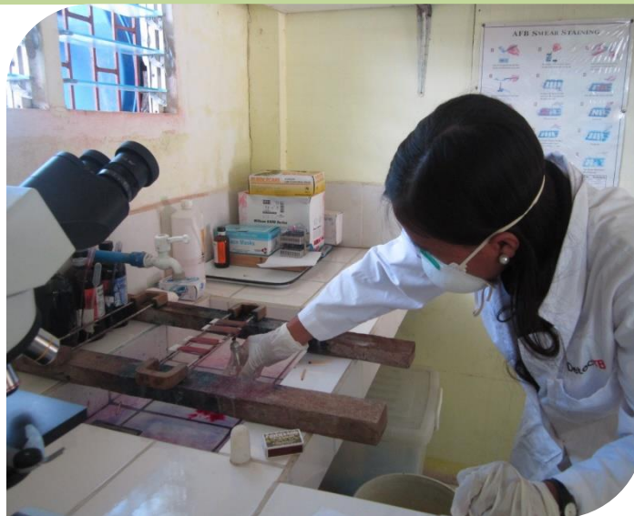
c. Health Caravan/Annual Medical Mission