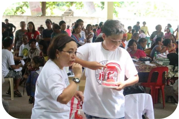
Learning session on oral hygiene for children