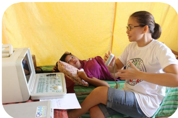
Ob- Gyne Ultrasound