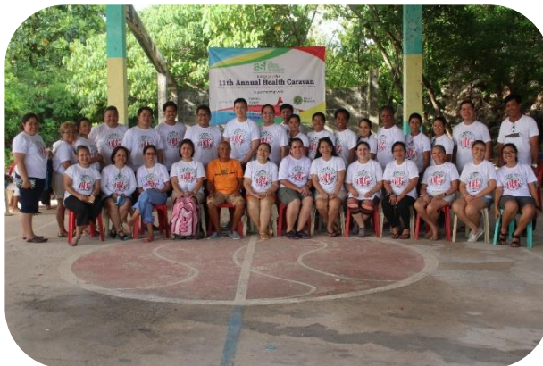
Doctors, volunteers and ASF Staff