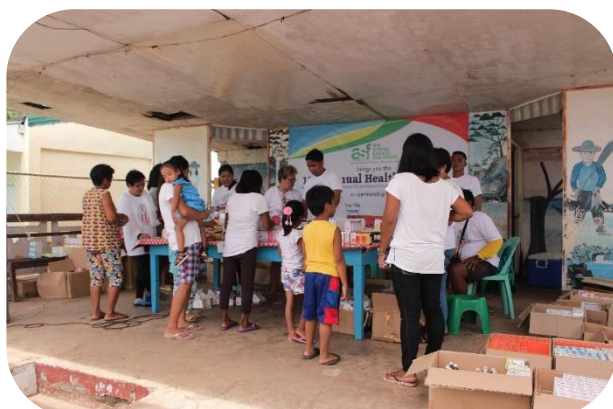
Distribution of free over-the-counter medicines and vitamins