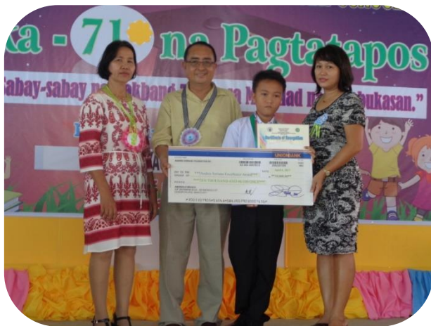
Awarding of Andres Soriano Excellence Award to School Valedictorian last April 2017 at the Andres Soriano Memorial Elem. School in Roxas, Palawan