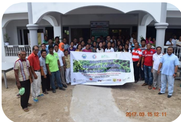
Quiniluban Seaweed Farmers Development Congress March 13-15, 2017 at Brgy. Concepcion, Agutaya