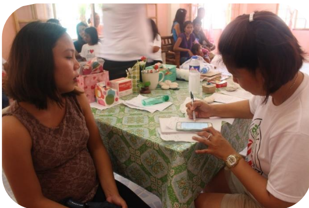
Pre-natal check ups