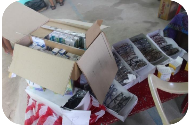
Eye Care and free reading glasses