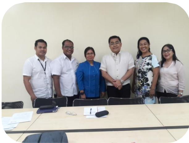
Meeting with DepEd Officials at DepEd Central Office with Usec Tonisio Umali